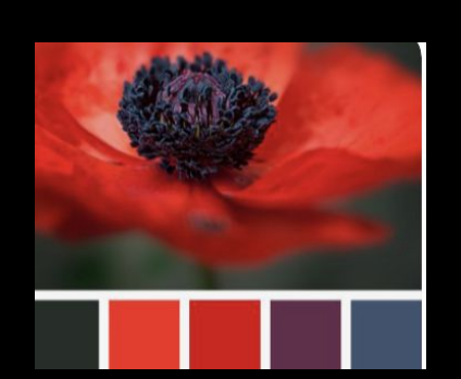
Secondary color palette