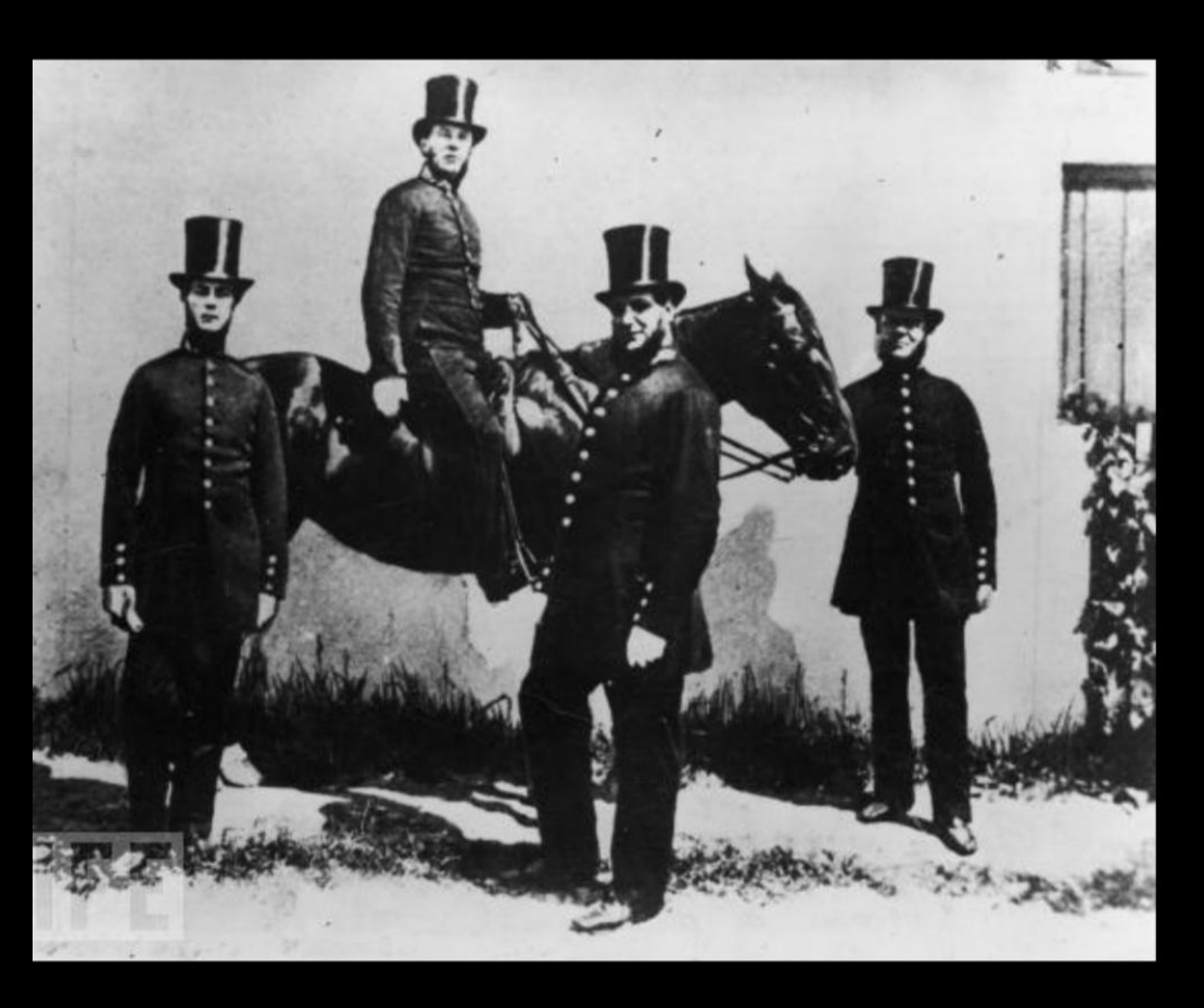
Authentic Victorian Period Wardrobe.